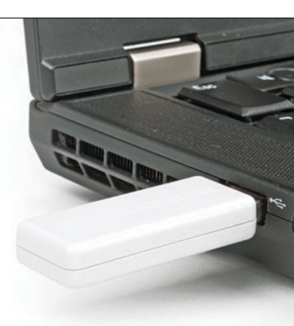
Figure 1-3: USB Dongle plugged into Laptop USB host connector

Unfortunately not. If you lose your dongle you will need to buy a new compiler license and pay the full price.